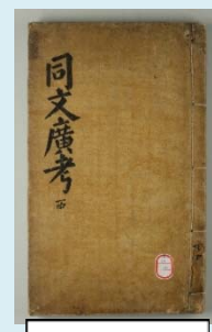
4. Chōsen toji