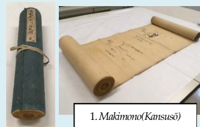
1. Makimono ( Kansusō )

It is said that this is the oldest form of book binding with paper. There are a cord attached at the beginning and an axis attached at the end of a paper which is long horizontally joined in sequence, then the paper is wound around the axis and it is tied up with the cord.