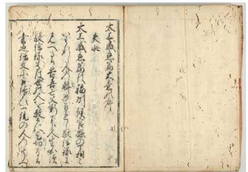
Taijō kan'nōhen tai'i

Or, there was a method of printing books with wooden blocks on which texts or illustrations had been engraved. The books made from woodblock printing are known as block books. Among them, the block books made from woodblock which was engraved in Ryūkyū are called "Ryūkyūban". For example, Taijō kan'nōhen tai'i from Miyara Dunchi/Douchi Collection is a copy of Taijō kan'nōhen which was the most representative book of moral education in China, it was engraved and printed by Dana Sōkei and Sōsō (father and son) of Ryūkyū in 1858.