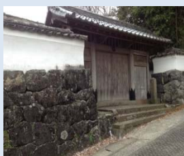
Roofed gate of the Hara House (Kashima-City)