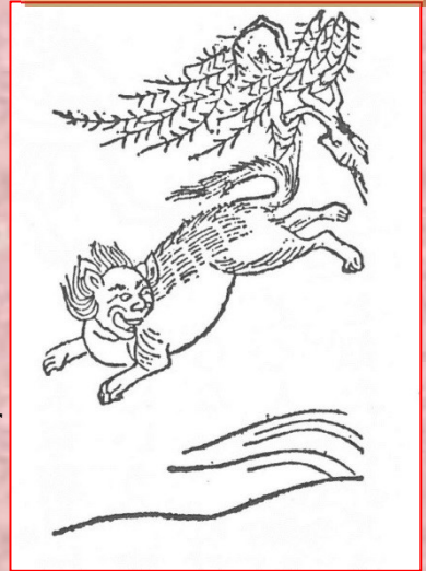
"Sankai" Tōyō bunko 466 Wakan Sansai zue 6, P151