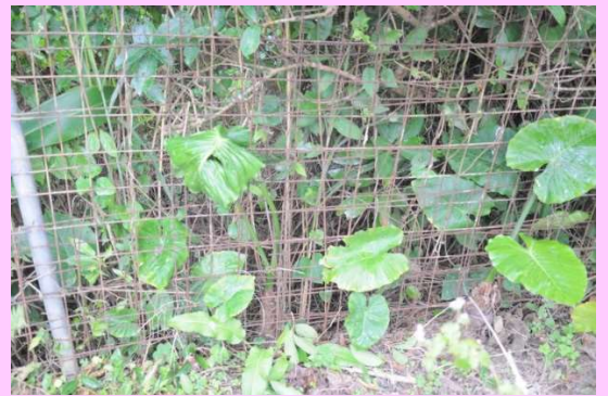
(A site of tank ditch)

Haisai & Haitai, everyone! It's getting colder, take good care of yourself. Well, let's get it started!