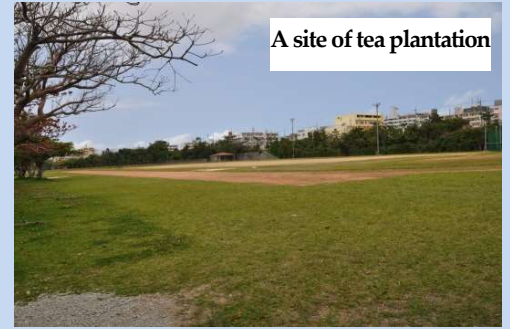
A site of tea plantation

Near a gymnasium of Ryūdai present-day, there was a mountain called Chāyama which was used as the Ryukyu's first tea plantation in Ryukyu Kingdom era. The article, "Shō kei ō (King Shō kei), 1733" in a history book, Kyūyō provides its description. It is unfortunately not what it used to be.