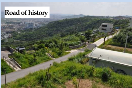
Road of history

Besides, on the hill, there is a memorial tower built for paying respects to 800 victims of Battle of Okinawa, called "Itokama no tō (Itokama Tower)."