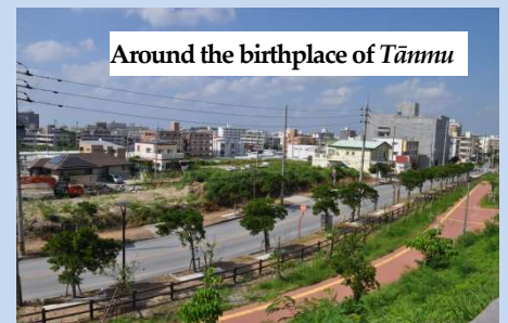
Around the birthplace of Tānmu